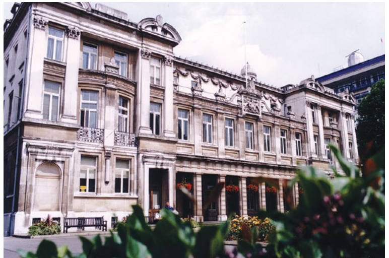
Queen Mary University of London